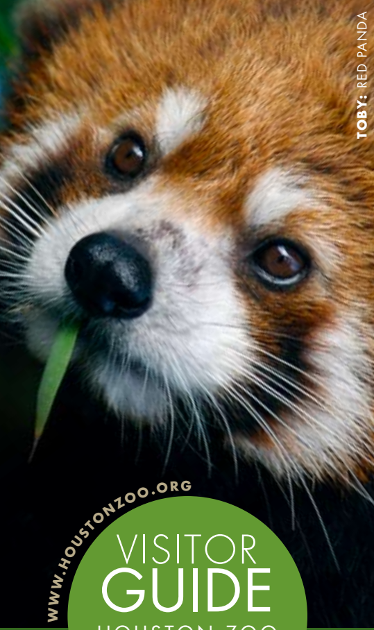
TOBY: RED PANDA

Learn more about Toby and Red Panda-monium at houstonzoo.org/cutestanimal